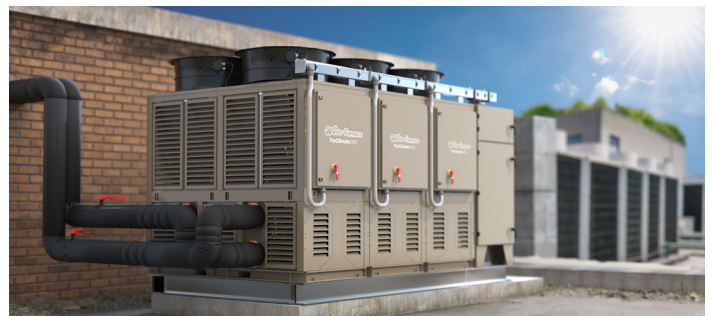
Game-changing performance in any weather condition