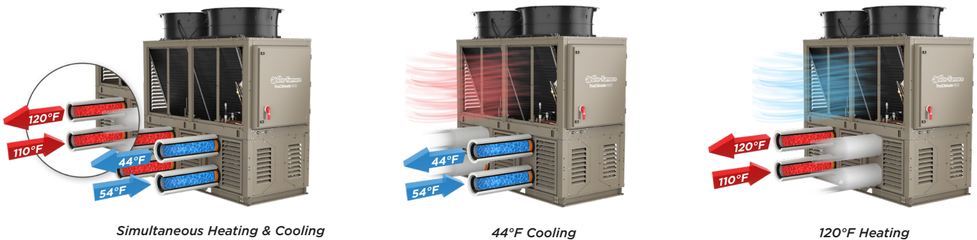
Simultaneous Heating & Cooling

Utilizing patented technology, the chiller can address diverse heating and cooling loads from a single chiller which can save money and frees up square footage. This is a WaterFurnace exclusive and dramatically reduces peak capacity and redundancy issues. Think of the space you'll save not having to double up your equipment needs.