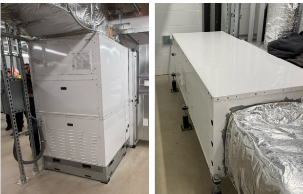
The design team selected multiple Versatec 500 and 700 water source heat pumps in both horizontal and vertical configurations.

Validated Custom Solutions (VCS), a WaterFurnace Commercial rep located in Indianapolis, Indiana, provided the expertise for which units would be best for the project. Their design team selected multiple Versatec 500 and 700 water source heat pumps in both horizontal and vertical configurations, and a Versatec 700 Indoor DOAS water source heat pump with an energy recovery wheel with bonded desiccant. Strategically, the team also added hot gas reheat on the Versatec 500 systems, which along with the desiccant wheel on the DOAS unit, helps dehumidification efforts during the months with the heaviest traffic.