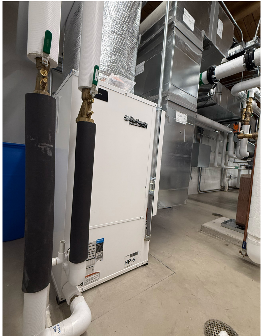
WaterFurnace systems installed in the McMillen Family Pavilion—designed to fit through a standard doorway—solve today’s design challenges while offering future flexibility.

The grand opening for the McMillen Family Pavilion was held December 4, 2024. And no matter the weather outside or the amount of people hosted within the structure, the guests are sure to be comfortable inside.