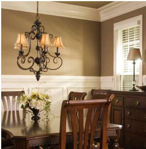
Light flicker associated with your unit can be a thing of the past...