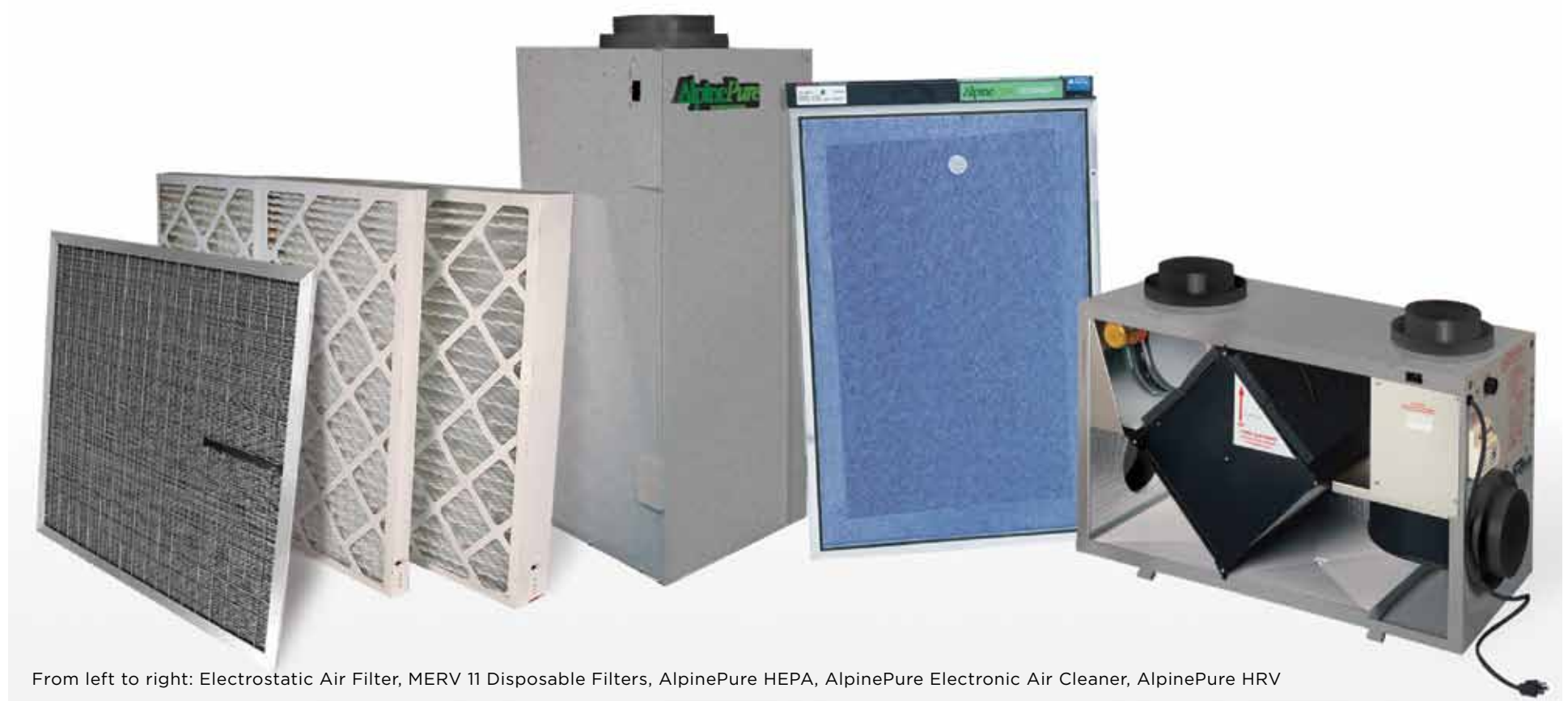
From left to right: Electrostatic Air Filter, MERV 11 Disposable Filters, AlpinePure HEPA, AlpinePure Electronic Air Cleaner, AlpinePure HRV